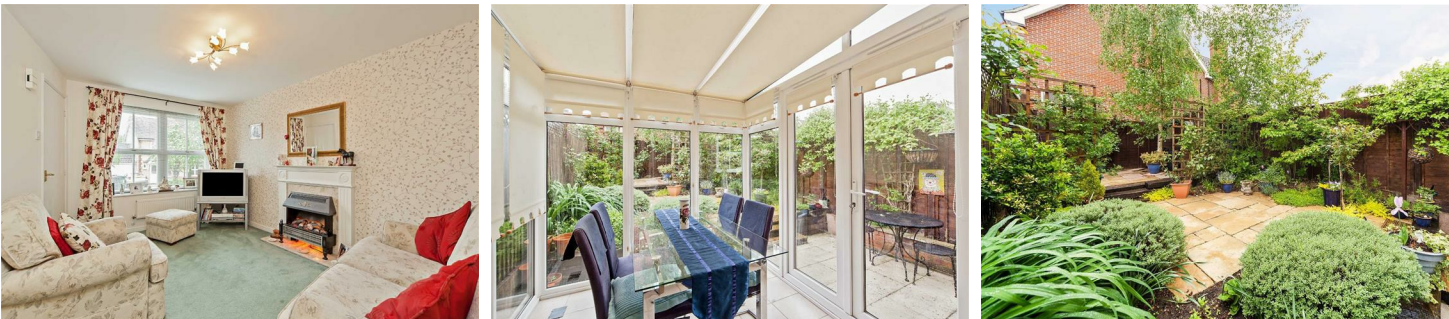
Ground Floor Approx. 40.6 sq. metres (437.3 sq. feet)

Situated in a cul-de-sac position and in close proximity to good local schooling, this modern end of terrace property boasts well presented accommodation to include a lounge, conservatory, kitchen/diner and cloakroom on the ground floor. On the first floor the property offers two double bedrooms, an en-suite shower room to the master bedroom and a family bathroom. The property is further complemented by a landscaped, low maintenance courtyard style rear garden and has the added benefit of two allocated parking spaces to the front of the property.